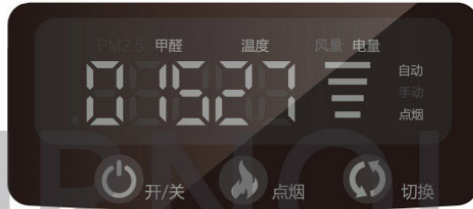
Air quality Inspection, Three Colors LED indicator

With the display, you can view the various values of indoor air quality in real time, such as PM2.5 value, formaldehyde concentration value, temperature, can also be understood in real time as well as the air volume and the condition of cigarette lighter